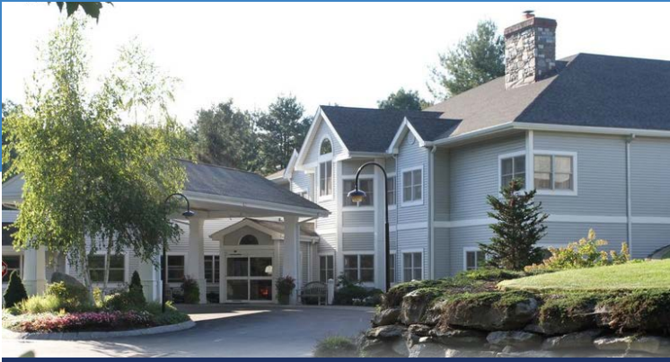
MASONICARE AT CHESTER VILLAGE