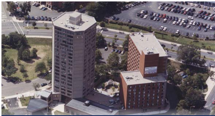
TOWER ONE / TOWER EAST