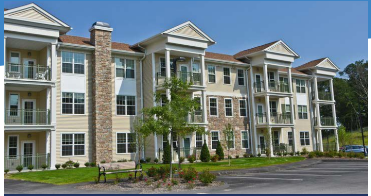
MASONICARE AT MYSTIC